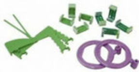
Uni-Verse-All Positioning Kit