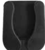
Wall Mount Holder