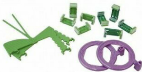
UNI-VERSE-ALL Positioning Kit