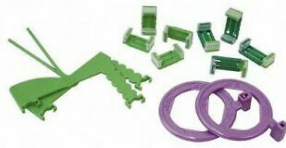
Uni-Verse-All Positioning Kit